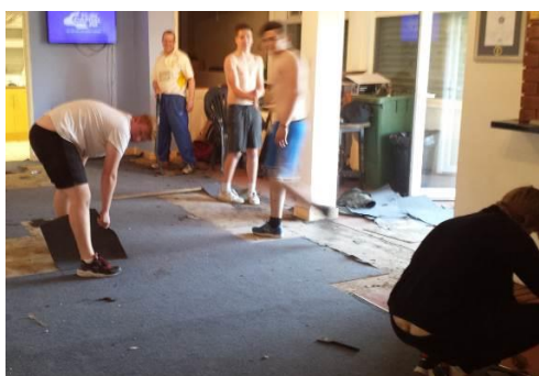
Who can spot the proper builder, during evening of the carpet removal?

Below are some photos of the before, during and after.