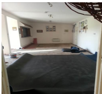
The new carpet work begins