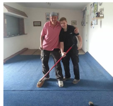
Nearly there, as fitters from Carpet & Flooring Direct admire their work